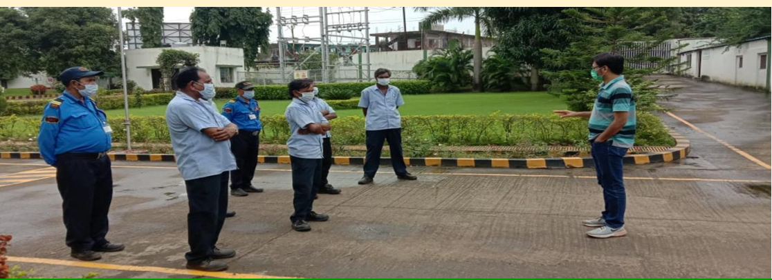
An awareness session on COVID-19 vaccination was conducted by the Company Doctor for the employees of Greases & Lubricants, Silvassa in the month of August 2021.