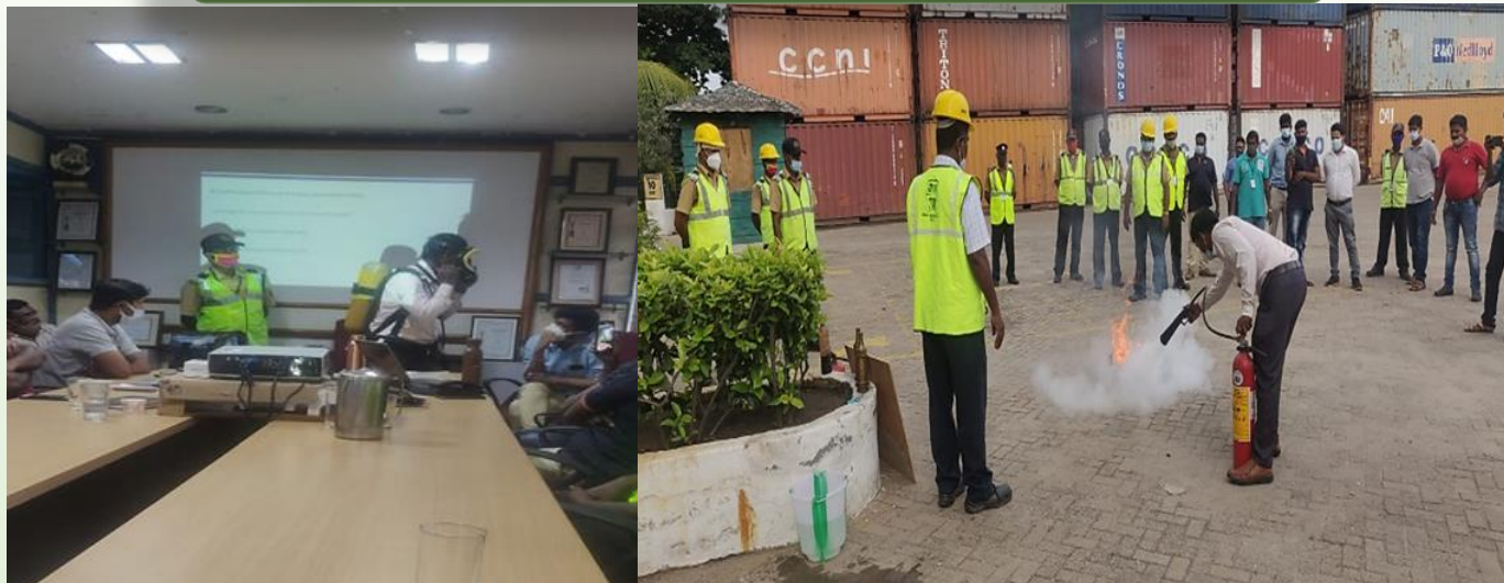
A training program on 'Fire & Hazardous Chemical safety' was organised at Container Freight Station, Chennai.